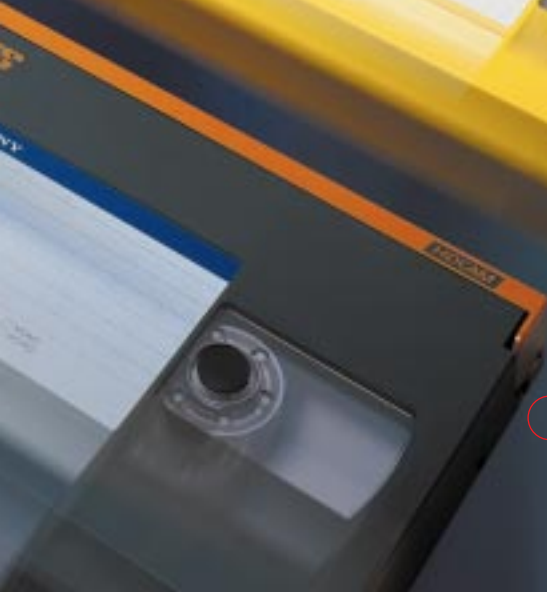
H D C A M