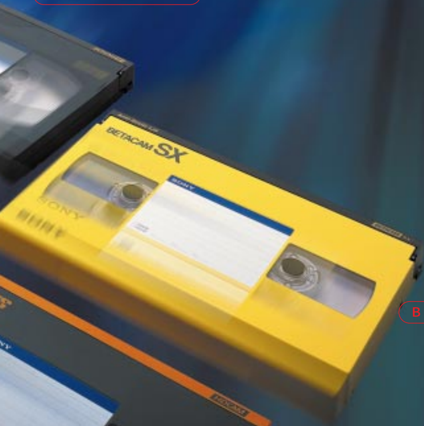
B e t a c a m S X